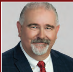
Harris County Commissioner, Precinct 4 R. JACK CAGLE