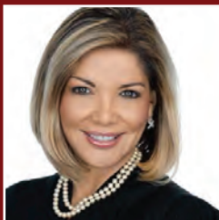
Texas Supreme Court Justice, Place 9 JUSTICE EVA GUZMAN

www.republicjudges.com/our_judges_candidates mke351@gmail.com